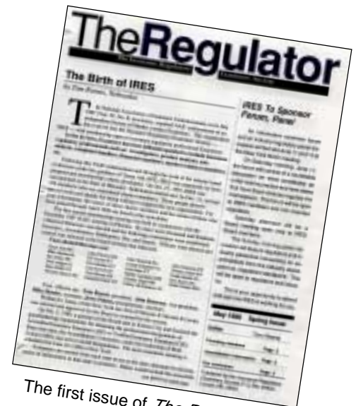
The first issue of The Regulator, May 1988

"I had been a member of SOFE," he said, "but at that time I was [New York's] assistant chief examiner of a product regulation bureau — market conduct and rate filings, etc. — and none of my