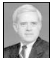
Flege of Kentucky