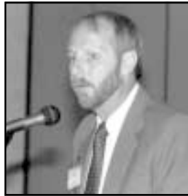
Reents of Nebraska